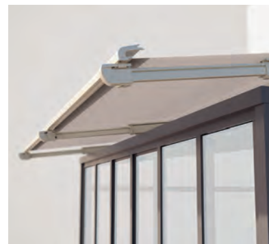
PS6100 Extending projection