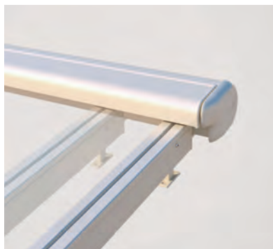
Adjustable guide rails